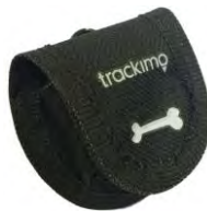
A Carrying Pouch